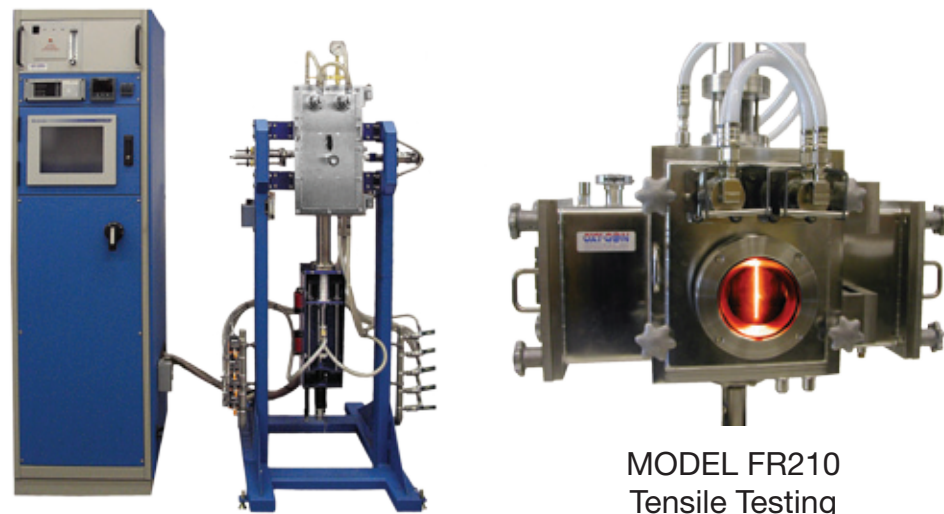
MODEL FR210 Crystal Grower